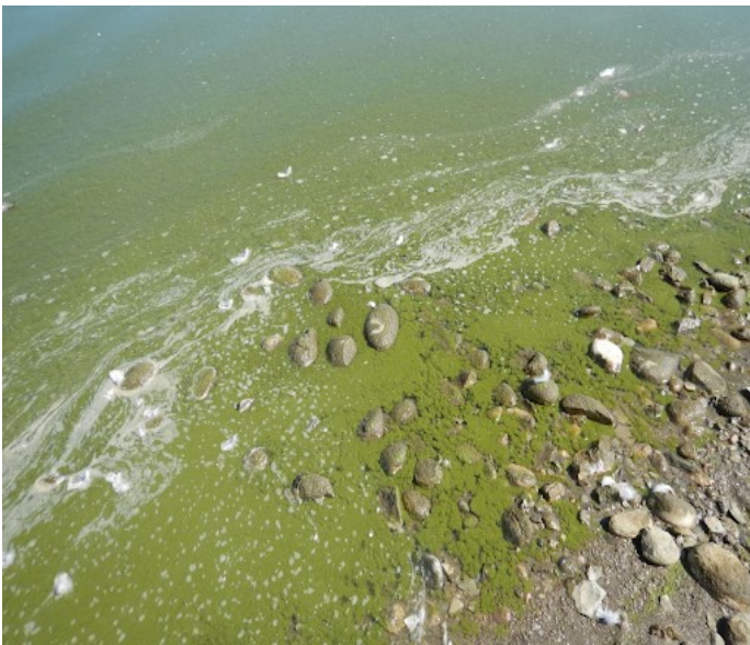
Algae Blooms from the Eden Reservoir in Sweetwater County Wyoming

If you see these blooms you should report them to the DEQ by calling 307-777-7501, or going online and filling out a report at WyoSpills.org